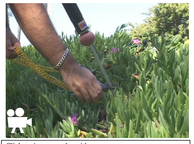
Click on image to play video.