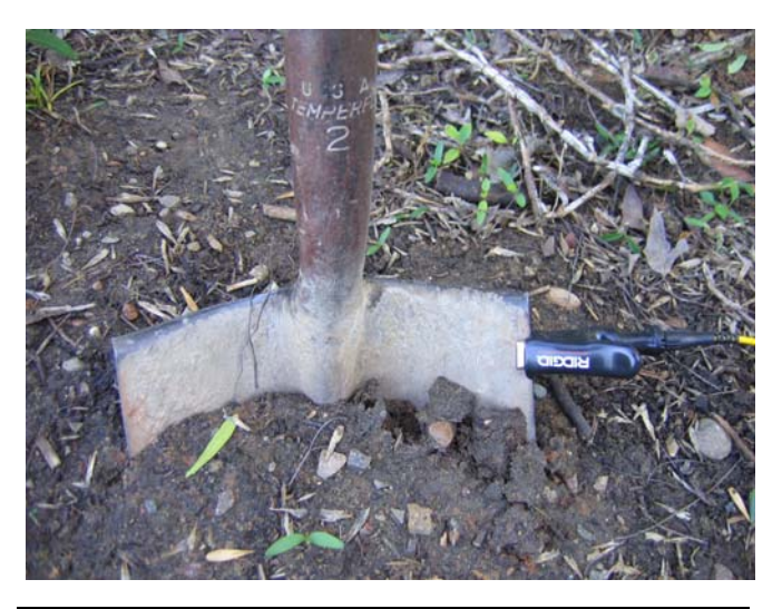
Like the antenna on a car, exposing more metal captures more signal.