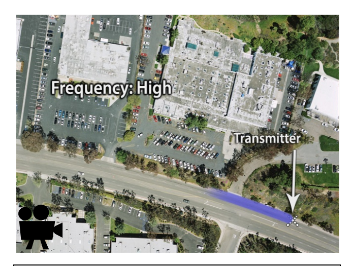
Click image to play video.