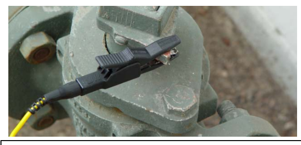
Good contact at the connection point aids current flow.

Solid metal-to-metal contact between the transmitter's clip lead and the connection point is essential for the efficient transfer of signal energy (current). Scrape away any paint, dirt, or corrosion, and work the clip's teeth into the connection point to get good metal-to-metal contact. The better the contact the less resistance there will be to current flow.