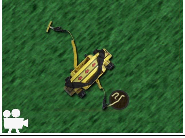
Basic locating circuit. Click image to play video clip.

the circuit,(less resistance) the more efficiently the current can flow, and the stronger the locatable signal. In this article we will explore what makes a good locating circuit for locating underground utilities and how to increase current flow to make locating easier and more accurate.